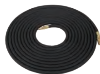
1 - Air Hose 3/8 in / 9.5 mm dia. x 16 ft / 5 m Black 22-890513