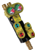
1 - Dual Deadman Bag Controller G2 22-890900G2-150