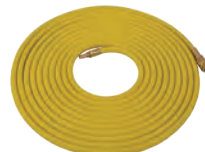
1 - Air Hose 3/8 in / 9.5 mm dia. x 16 ft / 5 m Yellow 22-890515