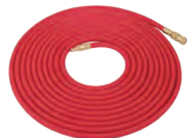
1 - Air Hose 3/8 in / 9.5 mm dia. x 16 ft / 5 m Red 22-890516